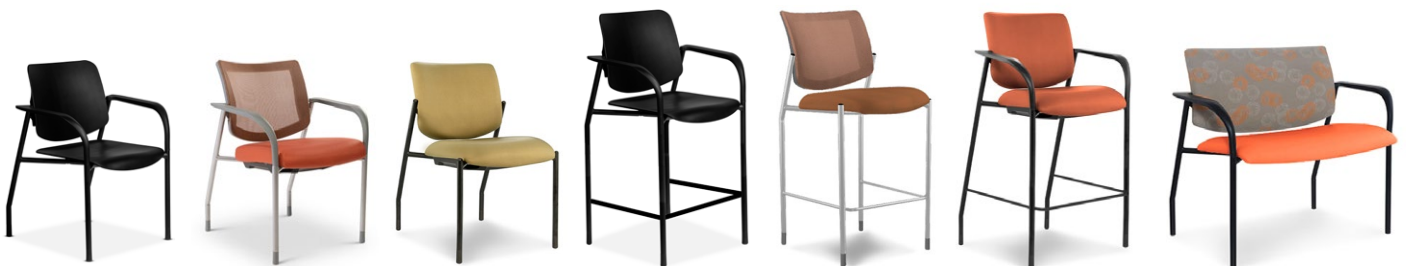
stackable poly chair